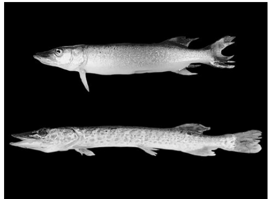
Figure 3. Tiger Muskellunge that were stocked in May 2016 into Lake Carl Etling, Oklahoma. The top photograph is an average size/condition Tiger Muskellunge at time of stocking (284 mm TL, 125 g, and relative weight = 108). The bottom photograph is a Tiger Muskellunge that was captured in Lake Carl Etling during the July 2016 electrofishing survey. This fish shows the effects of high temperature and increased turbidity on condition of juvenile Tiger Muskellunge (337 mm TL, 100 g, and relative weight = 49)

Out of all Tiger Muskellunge sampled, 76.6% had empty stomachs (no food items present), which may explain the overall poor condition (Figure 3) of juvenile Tiger Muskellunge and supports the plausible scenario that the fish were not able to forage efficiently under the conditions experienced in Lake Carl Etling. The remaining 23.4% of Tiger Muskellunge contained 5 species of fish and 1 species of invertebrate (Table 3). Gizzard shad composed the bulk of the diet, representing 43.8% of the food eaten ( V_i ) and was the most important diet item (56% IRI). Bluegill represented the second most important species consumed by Tiger Muskellunge at 15.1% (IRI), just ahead of Green Sunfish 7.2% (IRI). Both Gizzard Shad and Common Backswimmer ( Notonecta glauca ) were the most numerically abundant item consumed 25% ( N_i ), however Common Backswimmers ranked